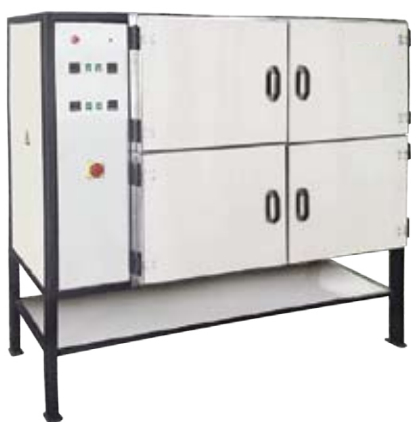
SNOL 4x80/200 LSN18