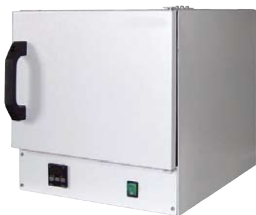
SNOL 24/200 LSP01

Economical low temperature electric ovens that are designed for the thermal processing of various materials and parts up to a temperature of 200 °C. The products can be used in scientific laboratories, educational institutions, medicine and industry. Optional forced air circulation (only in model SNOL 200/200) assures an even temperature distribution throughout the chamber and high quality thermal processing occurs quickly.