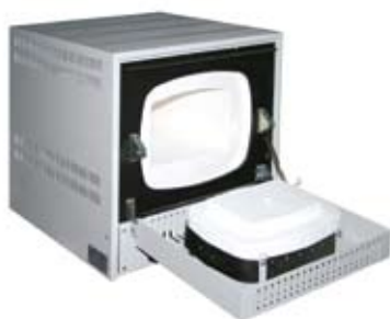
SNOL 8,2/1100 LZM01