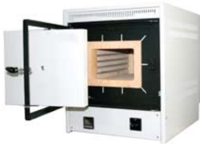
SNOL 7,2/1100 LSC01

Highly accurate laboratory electric furnaces with solid ceramic chambers. The products are designed for hardening, loosening, normalising and other thermal processing to a temperature of 1300 °C. The furnaces include ceramic bottom plates. To eliminate gasses or smoke that are released during thermal processing, ventilation hole and an exhaust system may be supplementally installed in the products. The furnaces are an excellent fit for scientific laboratories, educational institutions, medicine and industry.