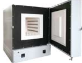
SNOL 40/1200 LSF01