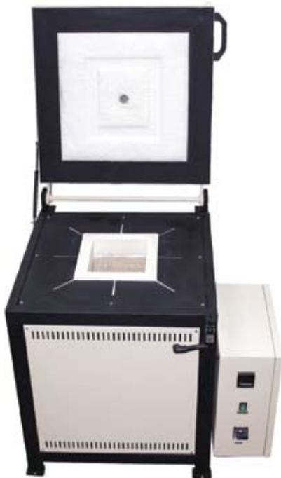
SNOL 10/900 LXC02