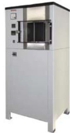
SNOL 8/1600 LSF01