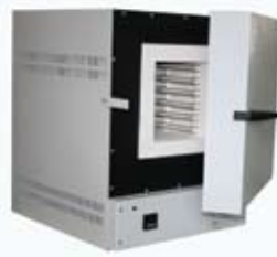
SNOL 30/1300 LSF01