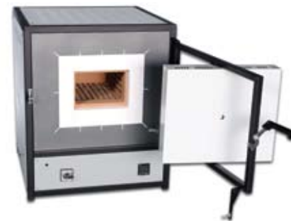
SNOL 7,2/1300 LSC01