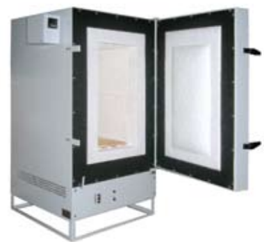
SNOL 80/1100 LSF01