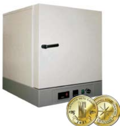
SNOL 60/300 LSN11