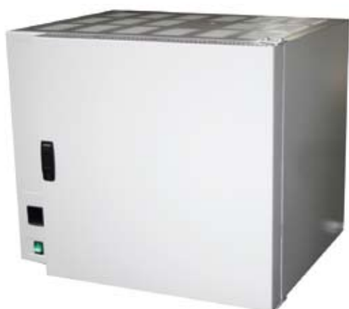
SNOL 67/350 LSN01