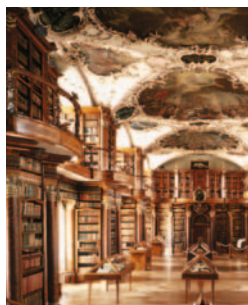
Museums, art galleries

The HygroPalm2-series (with integrated or interchangeable probes) is ideal for all applications where exact measurement of humidity and temperature is of decisive importance, e.g. the food and pharmaceutical industries, printing and paper industries, many trades, the sciences, meteorology, agricultural sector, climatology, etc. There is hardly a field today in which these parameters may be ignored. It is ultimately the measuring task at hand that defines the HygroPalm instrument that best meets your needs.