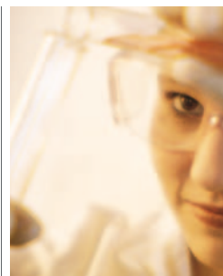
Healthcare, the sciences