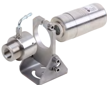
Series 54/55 with air purge unit and adjustable mounting angle