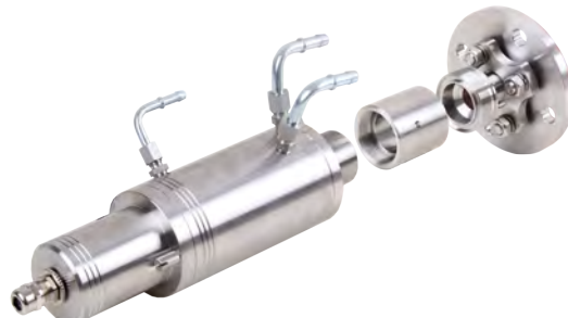
Series 54/55 with cooling jacket including air purge, sleeve for ball flange and ball flange